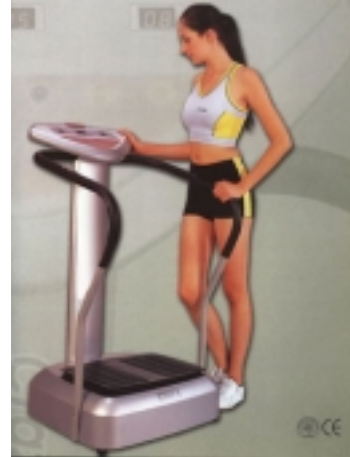
Women at risk for osteoporosis got a daily buzz on a vibration machine. www.myvibraslim.com

The experimental osteoporosis-fighting machine represents just one technology in a wave of new applications of electric and magnetic fields (EMFs) to bone injuries and related problems. All build on decades of work by physicists and surgeons. Though much of this work remains experimental, the Food and Drug Administration acknowledges that when properly applied, EMFs can make for good medicine.